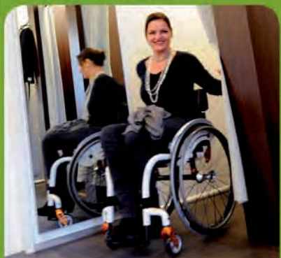
Helium Lightweight wheelchair